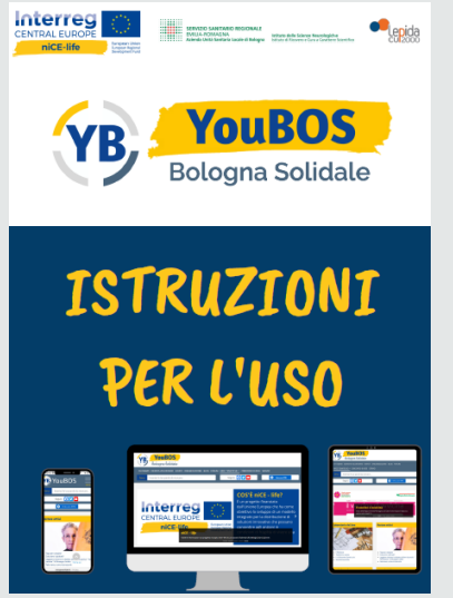
The front page of the Users' Guidelines