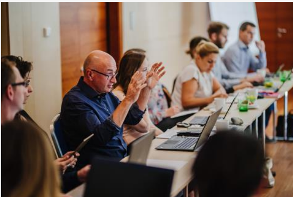
The 8th partnership meeting took place in Košice (Slovakia), on 10 th October 2018.