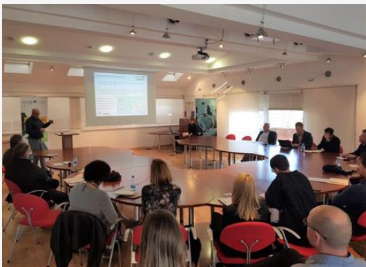
URBAN INNOvations in Local Environment