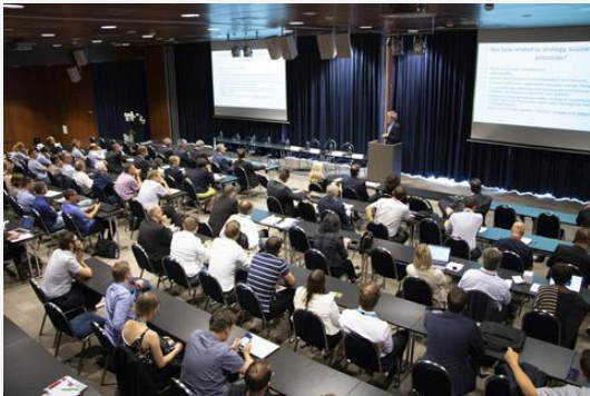
International Bled eConference 2018