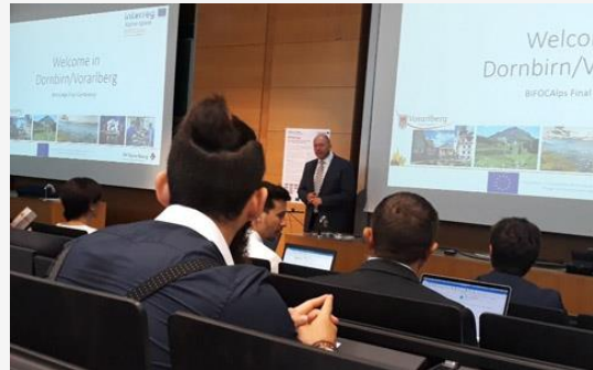
BIFOCAlps final conference