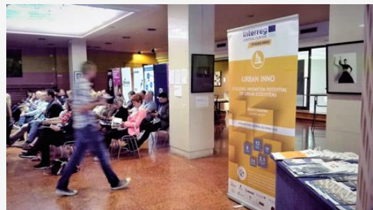
Business Take-off: Regional Conference in Rijeka