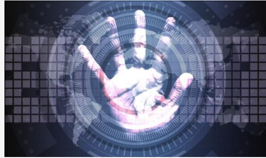
ICE/IEEE International Technology Management Conference 2018