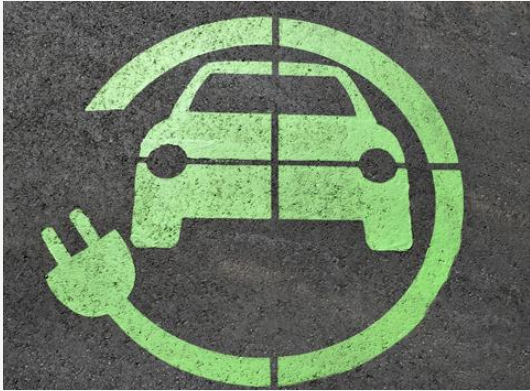
Economy fair Vorau ImpULS