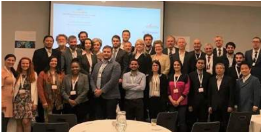
MOBILE GOVERNMENT WORLD SUMMIT Brighton, United Kingdom