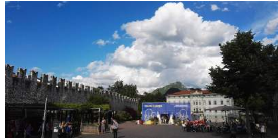
SIAMO EUROPA FESTIVAL Trento, Italy