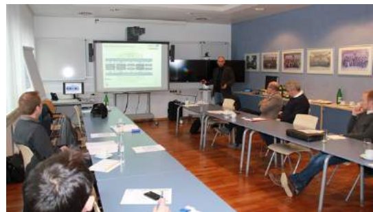
HARTBERG/PINKAFELD 1 st TRAINING Mentoring partner: CyberForum, GE