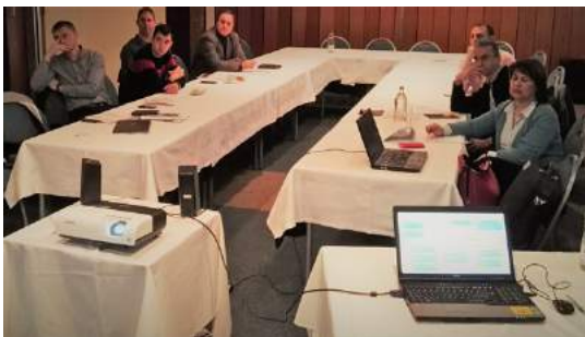
VAS COUNTY 1 st TRAINING Mentoring partner: Informatica Trentina, IT

All 5 core team training workshops were completed in the 2nd project period: the last two, in Kielce and Kosice region, on May 30th and 31th, by the mentoring partner e-Zavod. The second round is planned to be at latest by the end of September 2017.