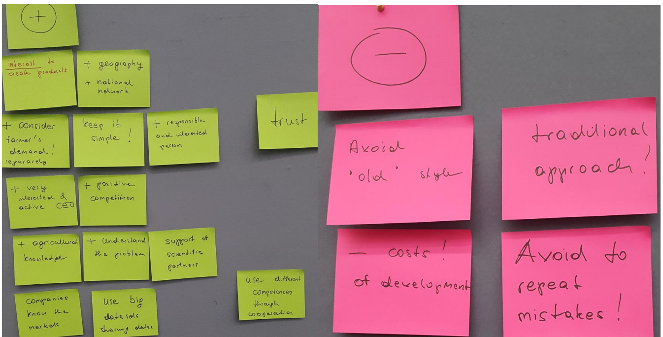
Figure 2: Results transnational capitalization seminar