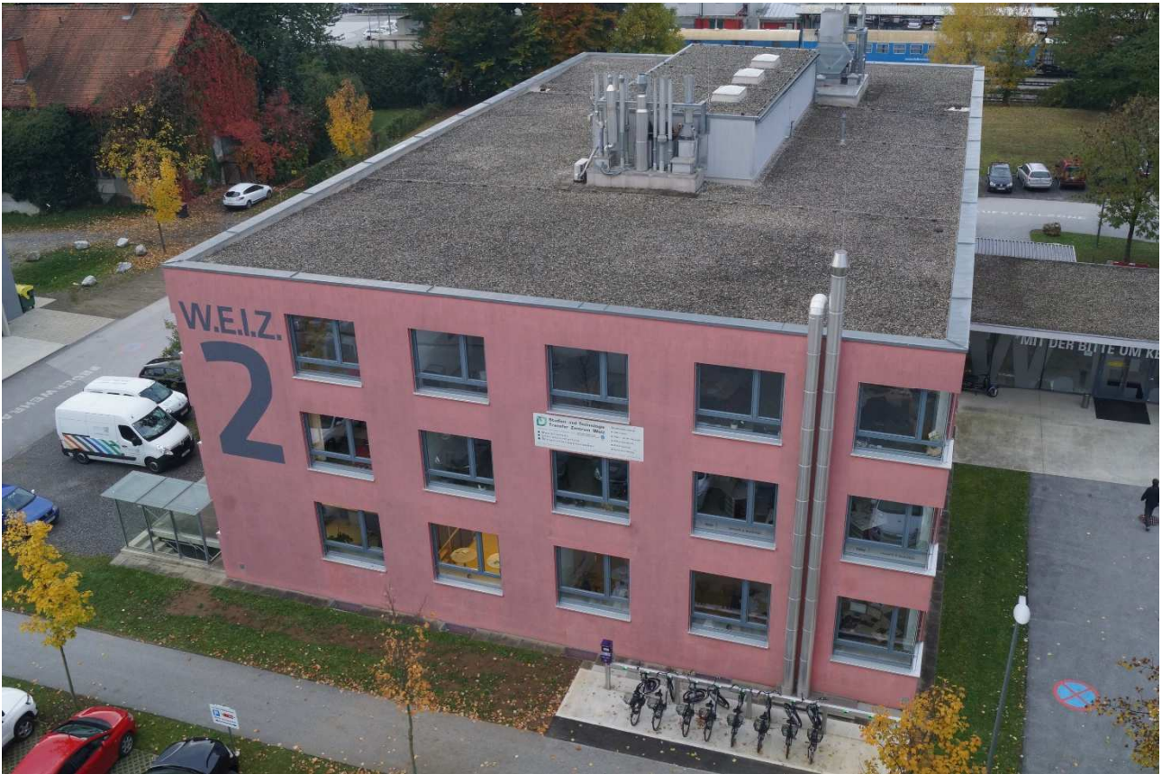
Figure 3: Pilot building W.E.I.Z. 2