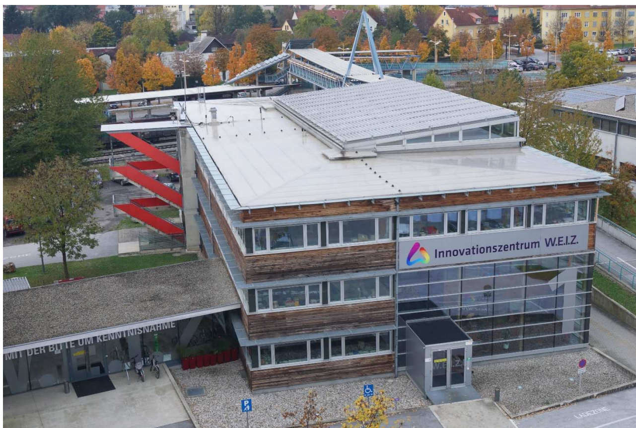
Figure 2: Pilot building W.E.I.Z. 1