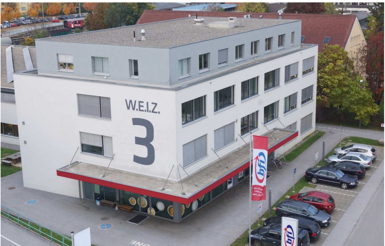
Figure 4: Pilot building W.E.I.Z. 3