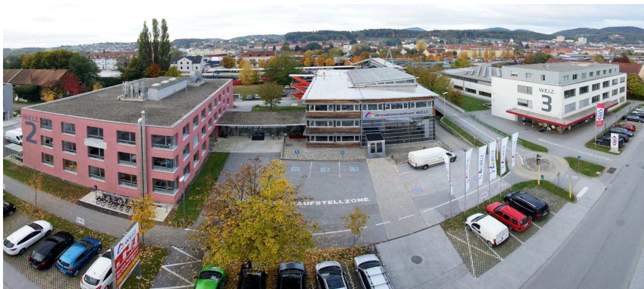
Figure 5: W.E.I.Z. Campus