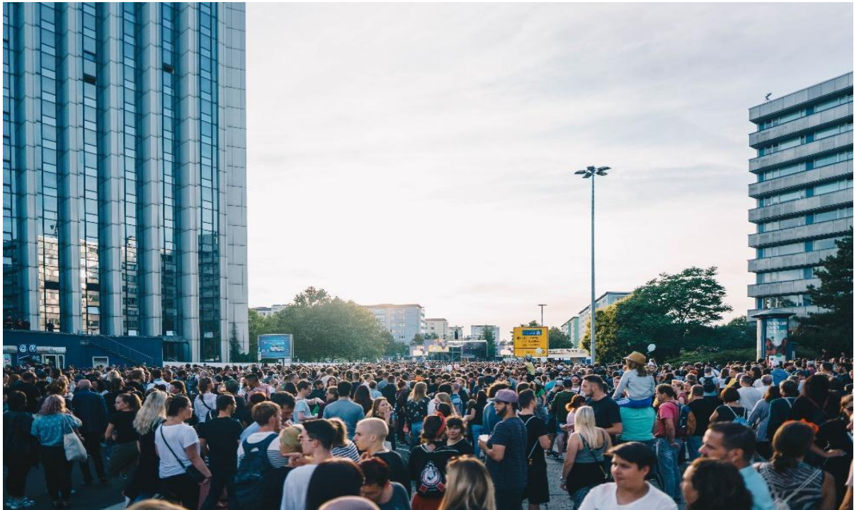
Picture 9: KOSMOS festival