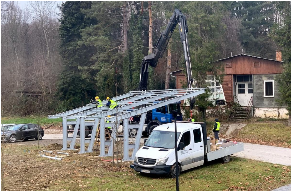
Figure 3: Canopy construction