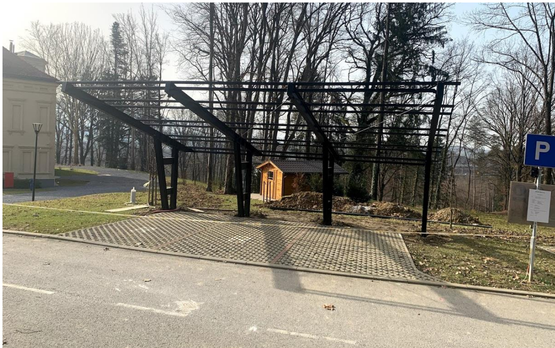
Figure 4: Canopy construction – painting

After the canopy was built, the painting was a bit delayed due to the weather conditions, but the construction was painted (Figure 4) as soon as the conditions were met. The colour of the canopy was determined by the conservation office. The selected colour is RAL 9017.