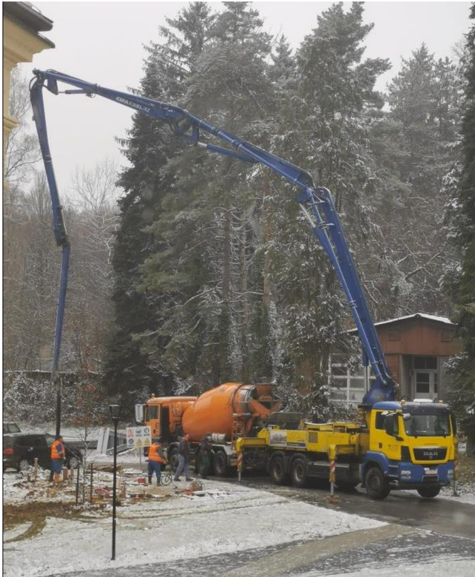
Figure 2: Preparatory works - foundation construction