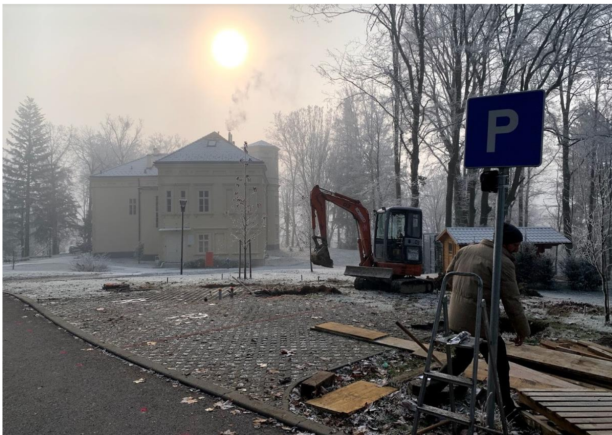
Figure 1: Preparatory works

After the public procurement for the execution of works, a Turnkey Contract was signed with the company Solaris pons d.o.o. and the official introduction to the work was held on November 2, 2020. During November, all preparatory and earthworks for the construction of the canopy were carried out (see Figure 1, and Figure 2).