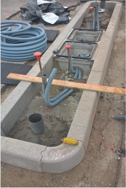
Fig 01-02-03 - Preaparatory works for installation of inductive loops and barriers