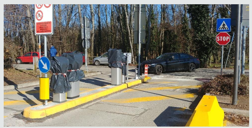
Fig 04 - the entrance of the Pilot site