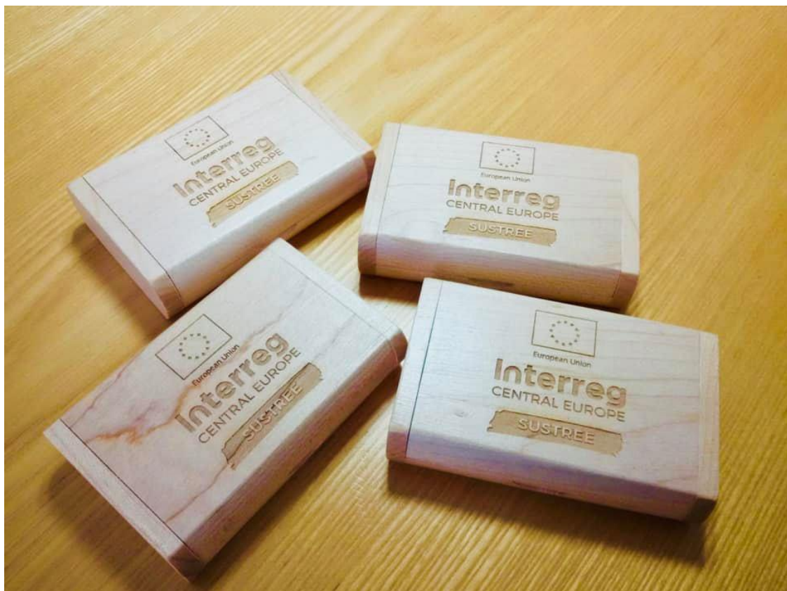
USB sticks held within wooden boxes, specially designed for the movie premiere in Prague

More than 200 USB sticks carrying the SUSTREE documentary movie in English and one with Czech subtitles were distributed among the audience at the venue of Svetozor Cinema.