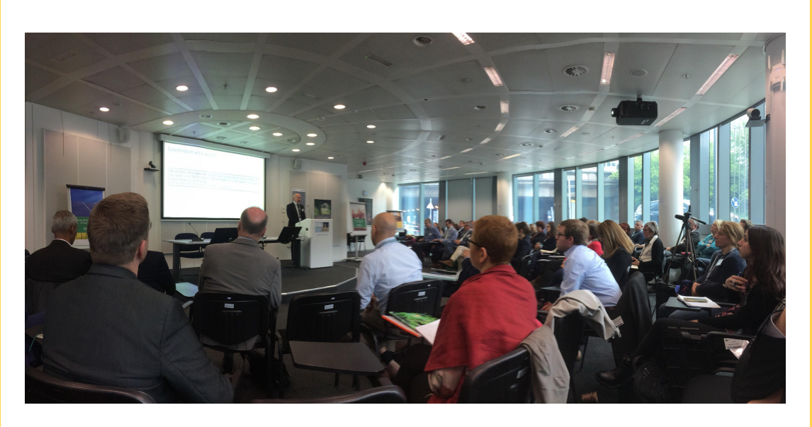
After 2020 perspective - Horizon2020 Info Day

Our guests from Brazil had a chance to visit Regional Observatories in Silesia Region - Central Mining Institute, University of Silesia and MedSilesia Cluster.