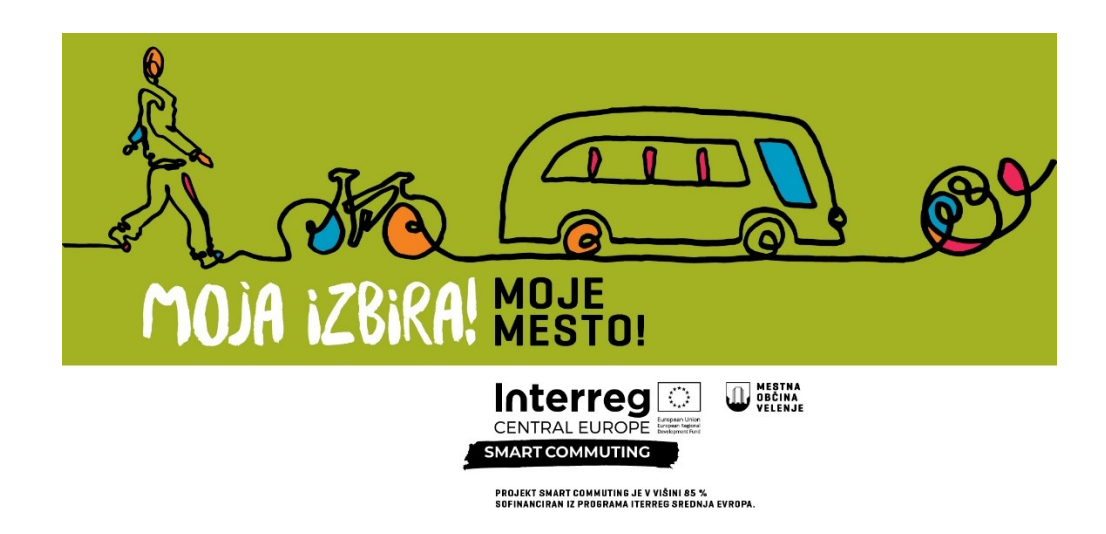
Figure 2: One of the images designed to be used for promoting of the events in Facebook.