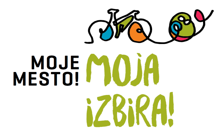
Figure 3: Figure promoting the use of bike.