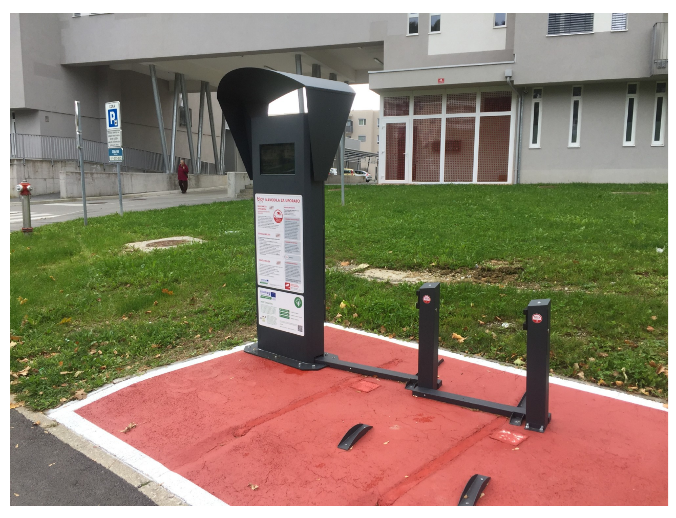
Figure 9: New rental station in Gorica.