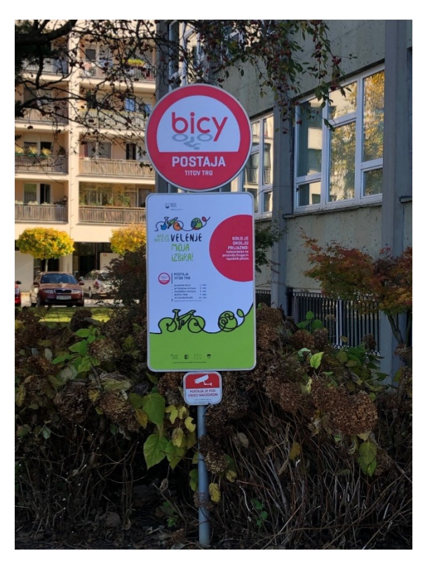
Figure 4: One of the sign boards on the bike renting station equipped with the same logo and design (financed outside oft he project).