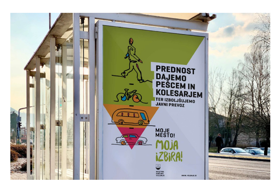
Figure 6: One of the posters (financed outside of the project)