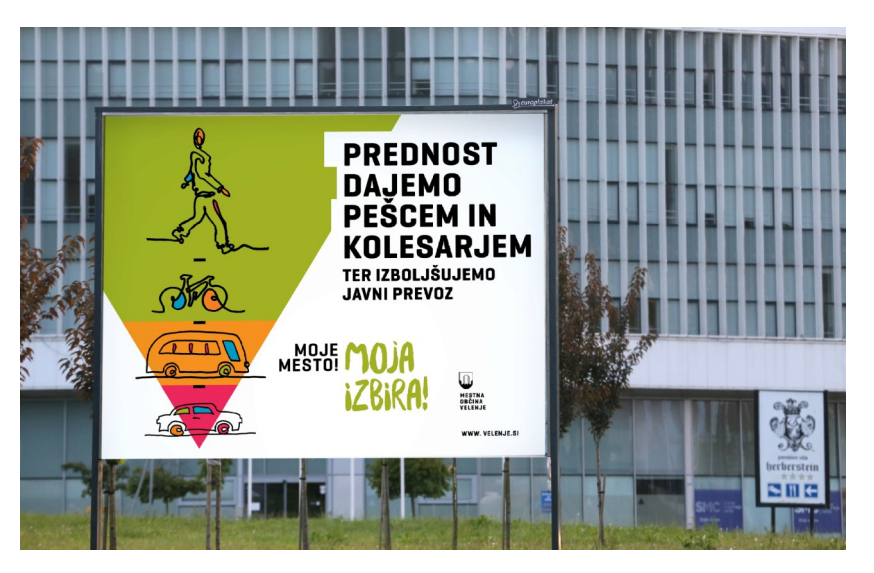
Figure 5: One of the billboards (financed outside of the project).