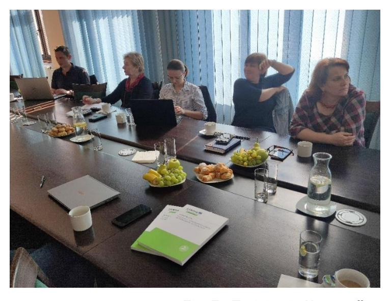
Fig. 7 - Training in Hustopeče