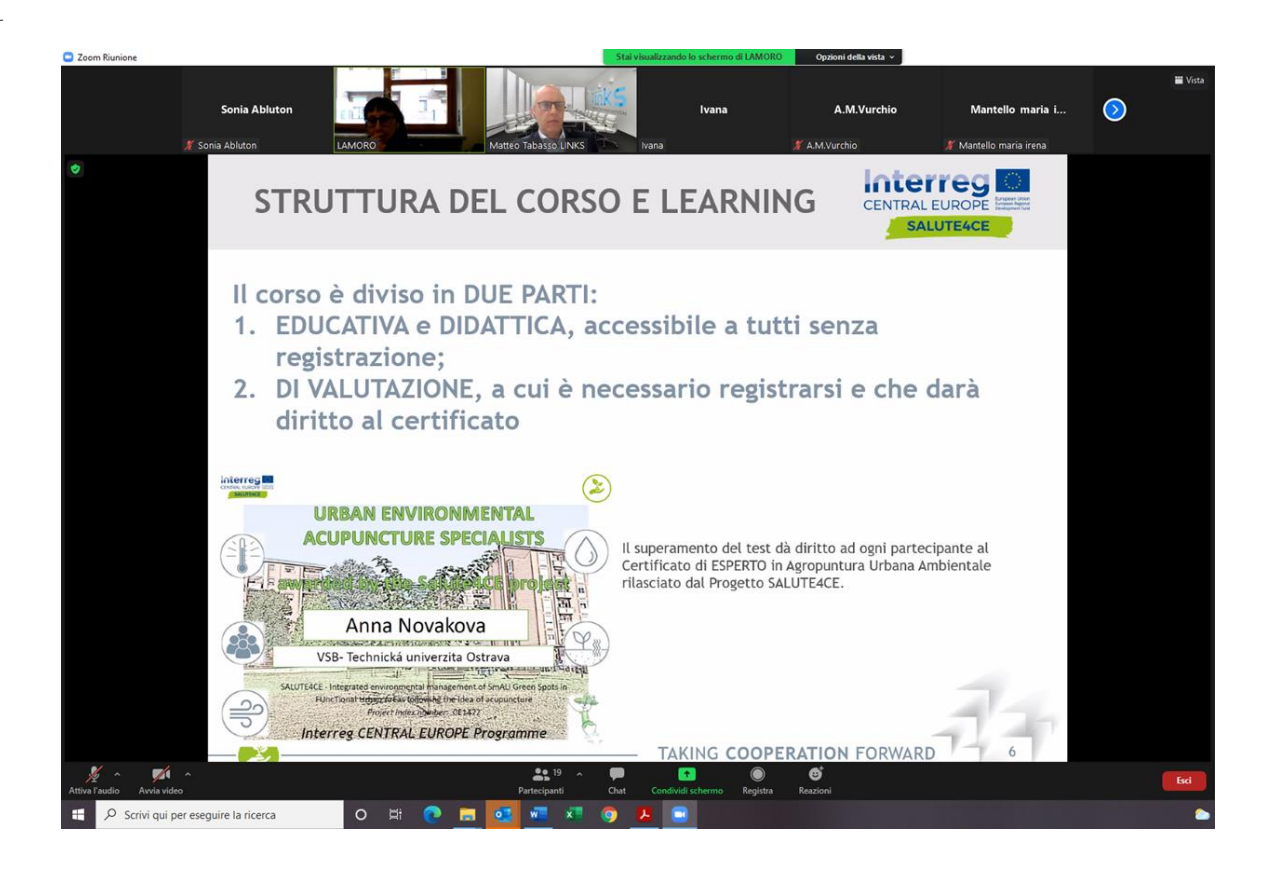
Fig. 3 - Training on UEA based on manual and handbook Agenda (in Italian)