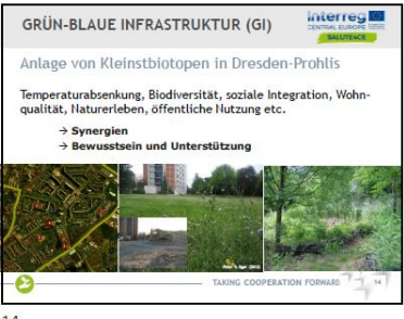
Fig 2 Part of presentation