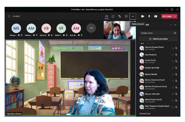
Fig.5 - Online training