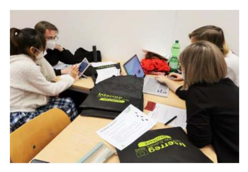
Fig. 1 Student group at the Dresden Technical University working with the SALUTE4CE

We offered all participants individual and group consultations. 17 consultations took place in February and March 2022. The Impulse Region supported this activity strongly, including practitioners from the city administrations of the FUA