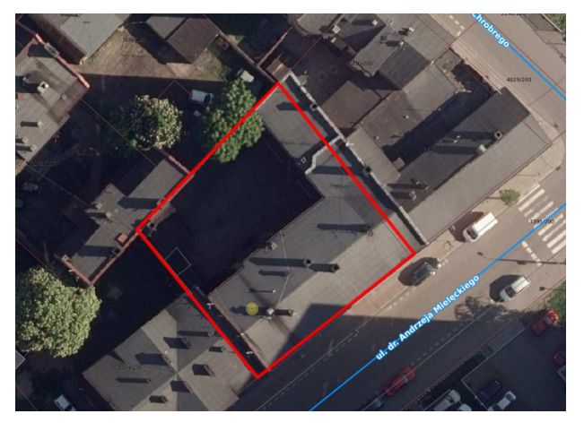
Site map, geoportal.chorzow.eu