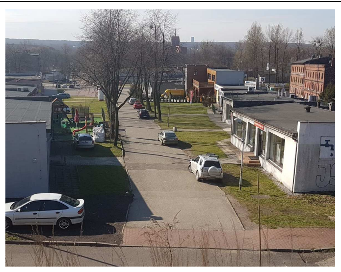
Site photo (may 2021)