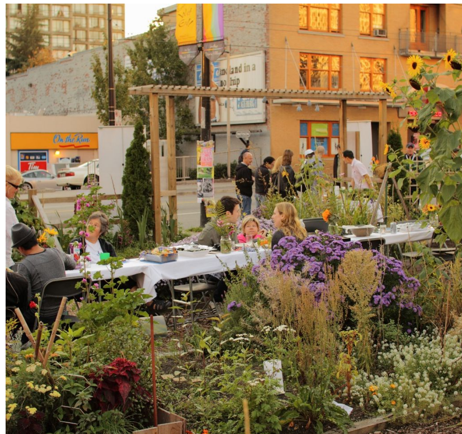
Dining in the Davie Community Garden