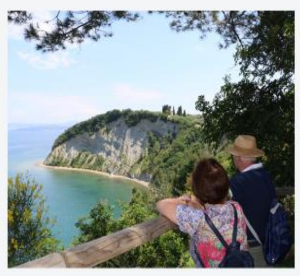
The Importance of the Buffer Zone