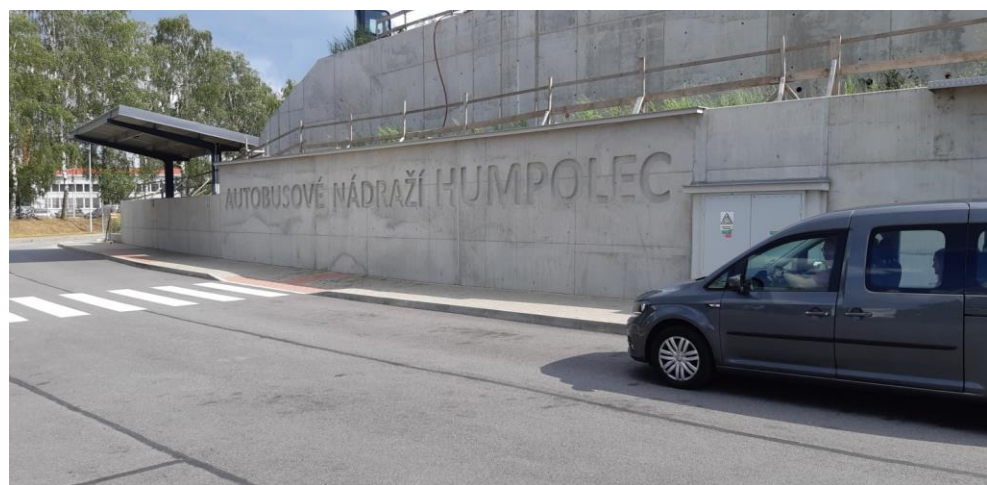
New dispatching system for South Bohemia Region