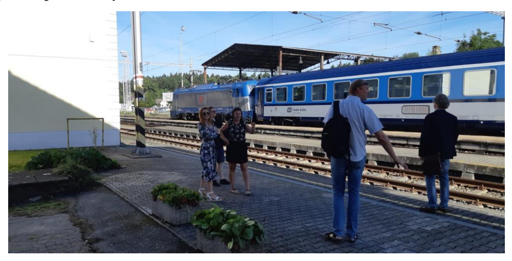
The 20th of August-Kaplice railway station