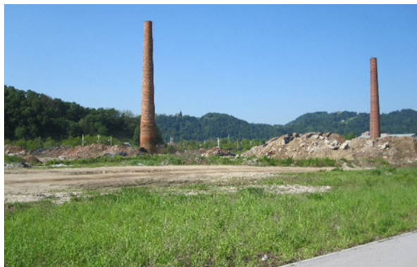
Figure 3 – A look on the pilot area