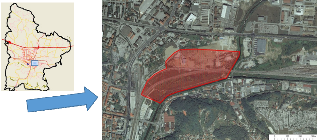
Figure 2 – ReSites PP3 pilot area location