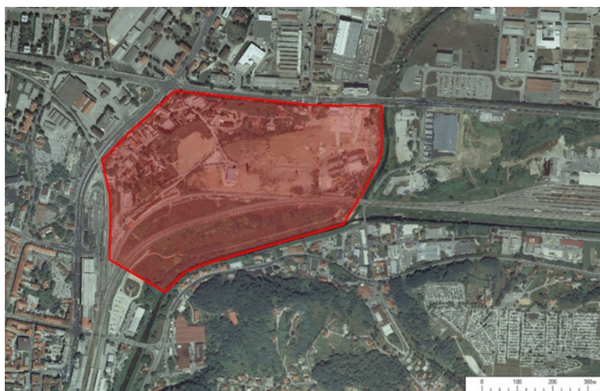
Figure 4 – ReSites PP3 wider pilot area location