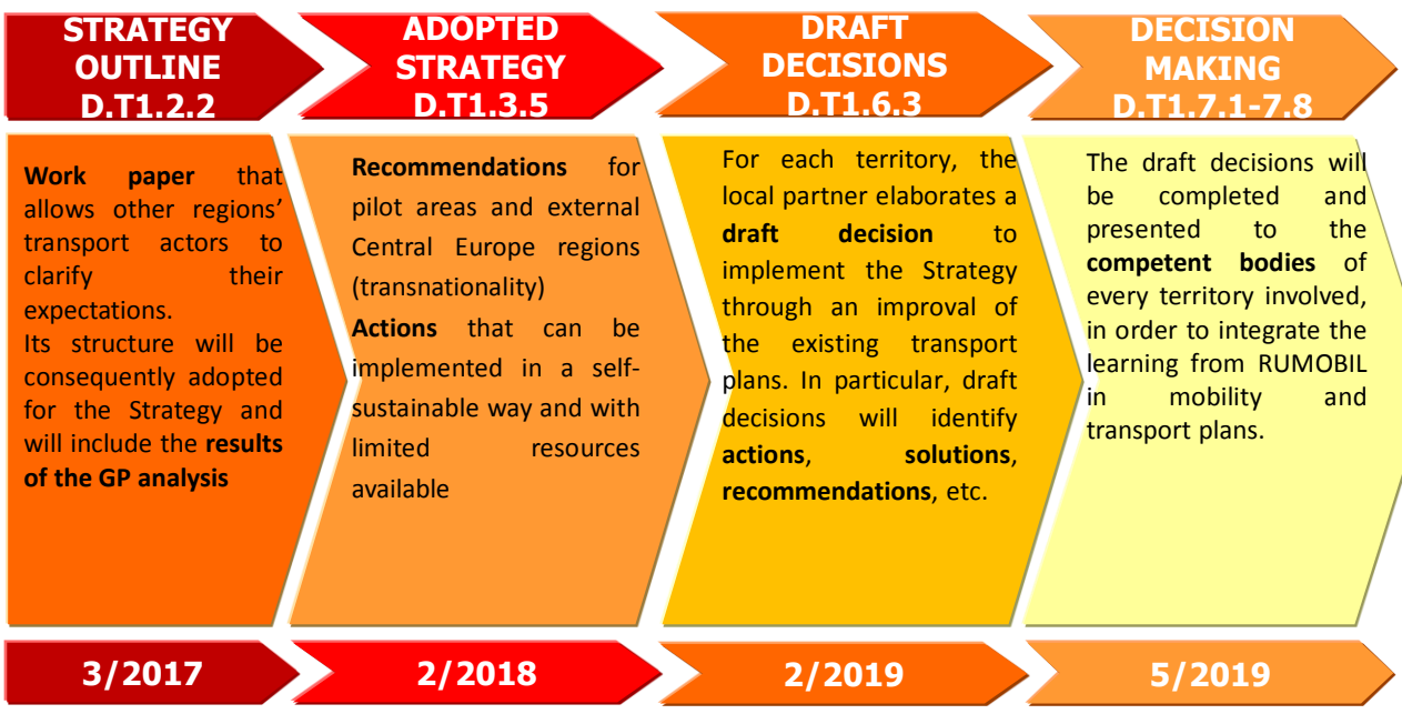
Figure 3 - Scheme of the four steps of activities in order to achieve the Strategy and to trigger the decision making process

The four steps regarding the Strategy and the decision making process can be synthesized as follows.