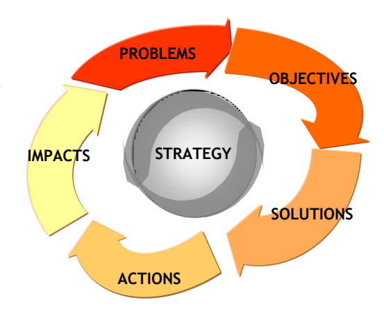
Figure 4- The features of the RUMOBIL Strategy

As detailed in "RUMOBIL Strategy Outline" and in consideration of the types of the possible benefits RUMOBIL highlights regarding the improvement of the connections between rural areas and TEN-T network, the Strategy will be focused on the development of a "service strategy"<sup>2</sup>.