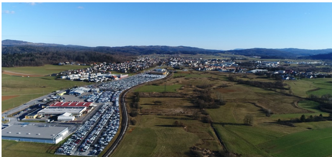
Car logistics centre for located near regional railway line Ljubljana-Kočevje