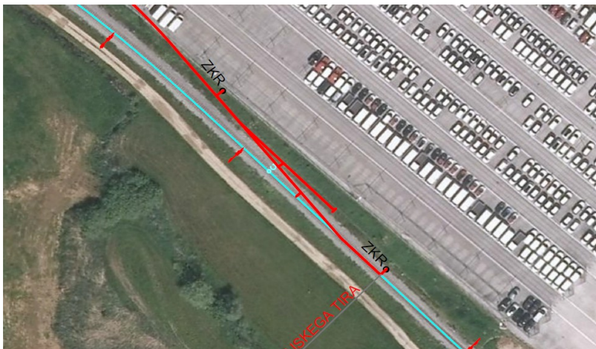
Missing link between private and public part of rail infrastructure (siding construction area)