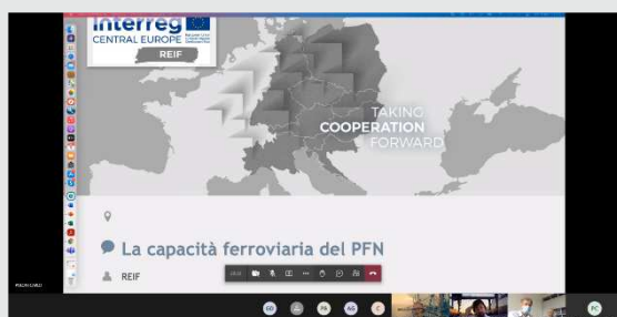
Figure 3: 3rd Regional Capacity Building Workshop