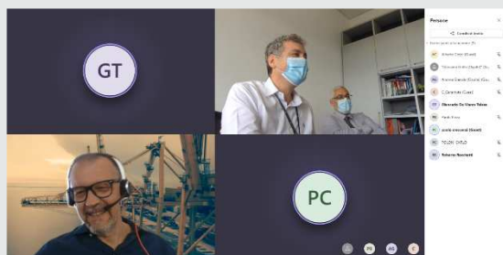
Figure 2: 2nd Regional Capacity Building Workshop