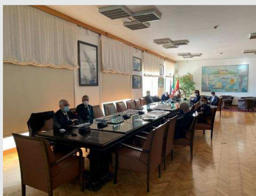
Figure 1: 1st Regional Capacity Building Workshop