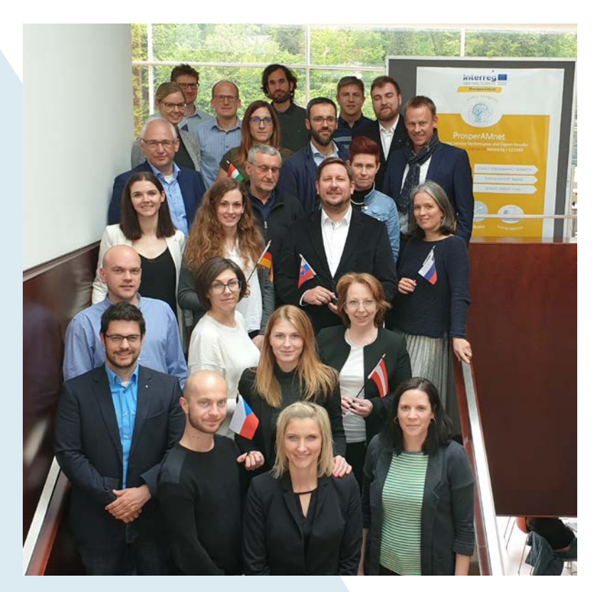
Group photo of the partnership at the ProsperAMnet kick-off meeting on 6-7 May 2019