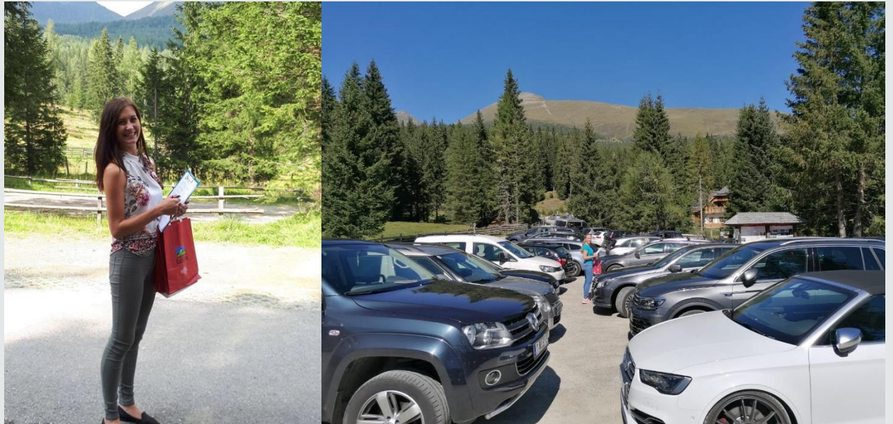
Picture 2&3: Visitor survey at the parking lots around the Lake Prebersee