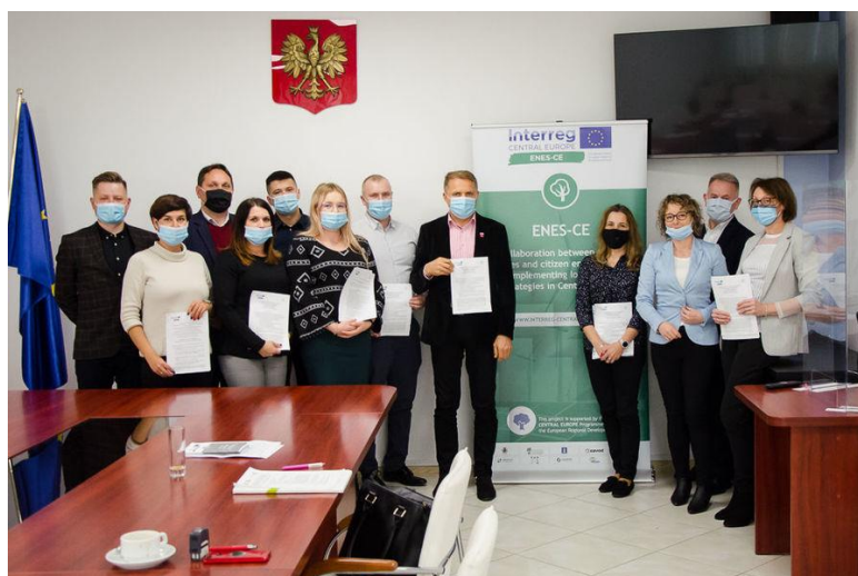
Establishment of Niemce Energy Cluster