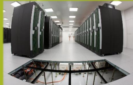
IT4 Innovation computing centre at VSB - TU Ostrava