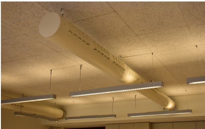
Mechanical ventilation in classroom