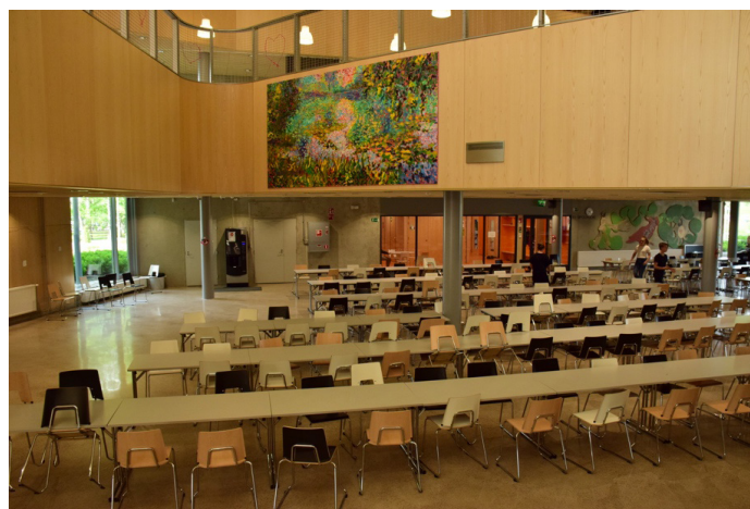
Dining hall as the center of school in Sipoo