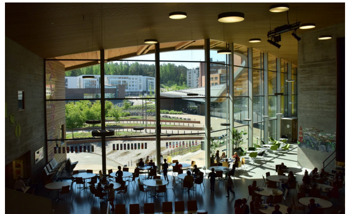
Main multifunctional hall (dining room, library, etc.)