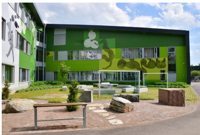
School exterior and playground

process and their new curriculum. The visit continued in the schools in Sipoo, two schools in Nikkilan, and Soderkulla School in Opintie.