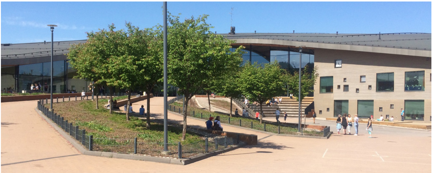
School as extension of indoor learning space, and as part of the neighbourhood and wider urban plan

The design of this house has emphasized safety and flexibility, fitted on the site and is aesthetically pleasant.