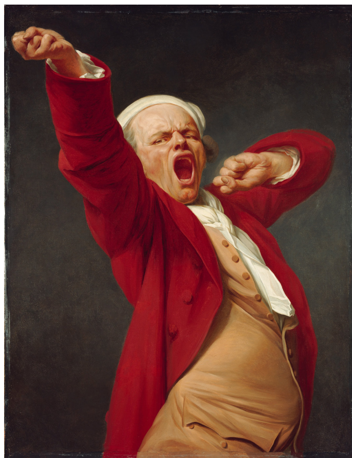
Joseph Ducreux, self-portrait c. 1783

Carbon dioxide levels in the classroom have been shown to be directly related to a student's alertness and ability to concentrate. High levels of carbon dioxide indicate a lack of fresh air intake and that negatively affects the health, attendance rate and learning ability of students.