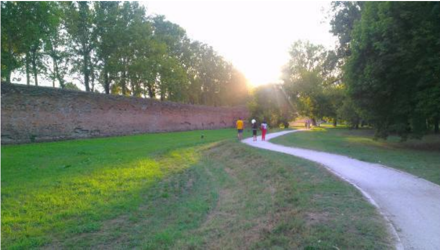
Different views of the Linear Park