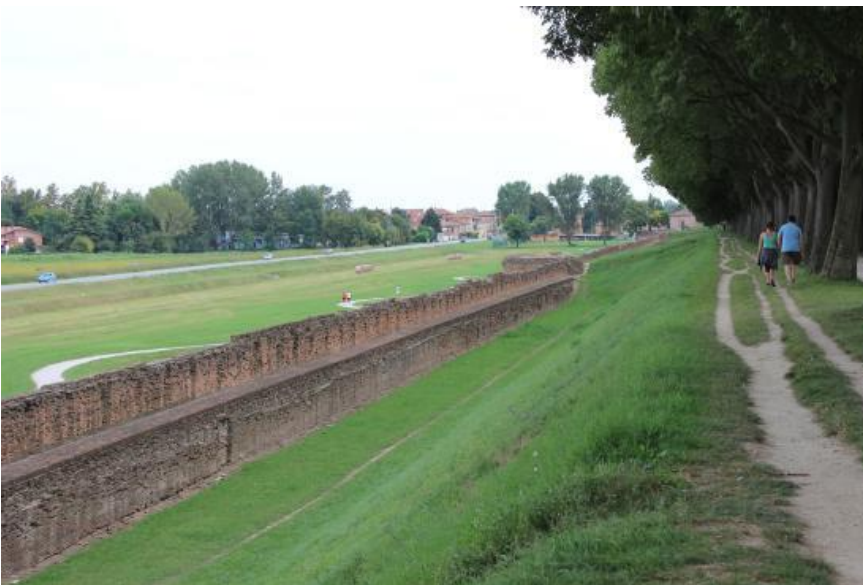
Different views of the Linear Park