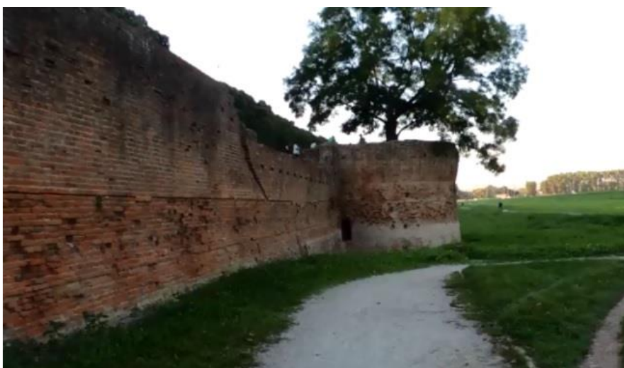
Different views of the Linear Park