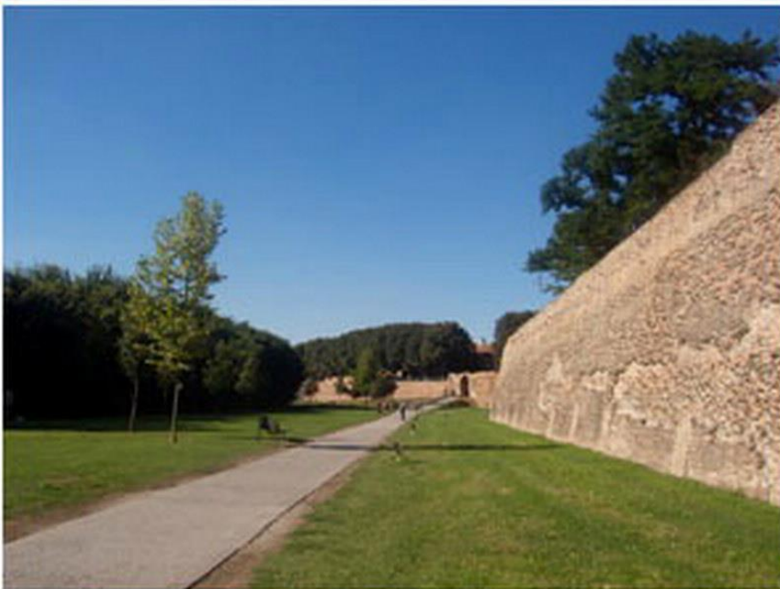
Different views of the Linear Park