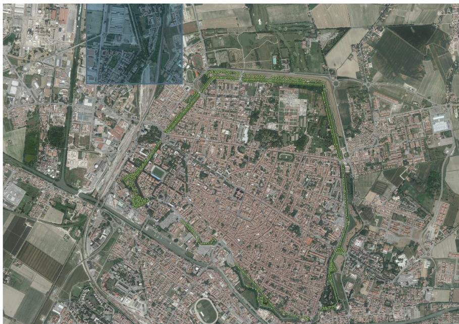
The Linear Park of the Este Walls, surrounding the Ferrara historical centre

cultural heritage present close to each sign, together with a QR code offering a direct link to the web pages where more details are given to the visitor.