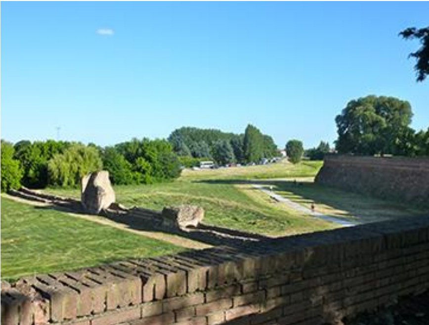
Different views of the Linear Park