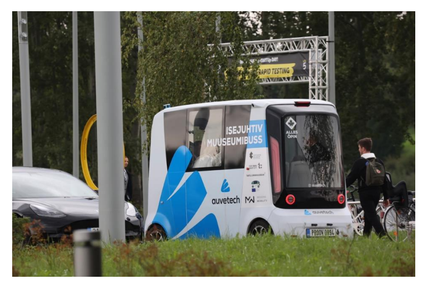
Figure 2: AV-Shuttle Pilot on Tartu (Ride2Autonomy)

With this in mind, Dynaxibility4CE developed a guideline for the CCAM integration in SUMP processes, leading the preparation of an SUMP Topic Guide for CCAM. Based on the existent Practitioner Briefing for Road-Vehicle Automation, developed by the CoExist project on 2019, Dynaxibility4CE thoroughly analysed current support needs and knowledge gaps, cooperating with ongoing projects like ART-FORUM, PAV and Ride2Autonomy.