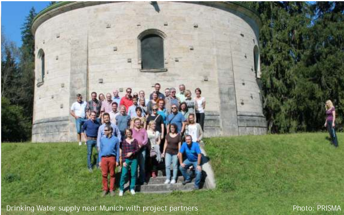
Drinking Water supply near Munich with project partners

On day two, the Lead Partner presented project and financial management related issues and communication aspects to the project's Steering Committee. In the afternoon the participants had the possibility to take a glance at the drinking water protection areas of Munich. A guided tour to the Taubenberg a best practice example for water protection forest management - brought the meeting to a perfect end.