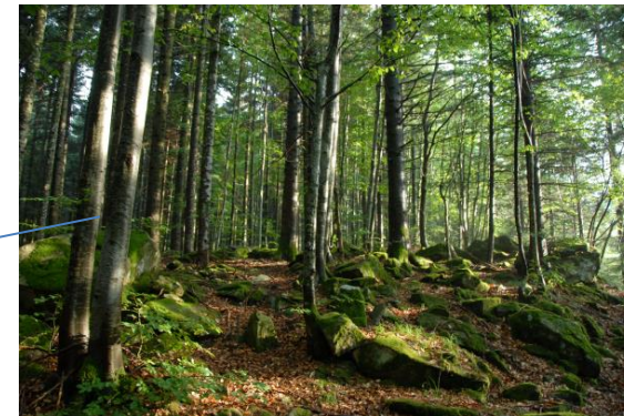
Pietra di Bismantova