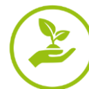
Plastika Skaza: materials used in production process