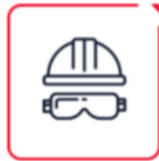
Work Health & Safety