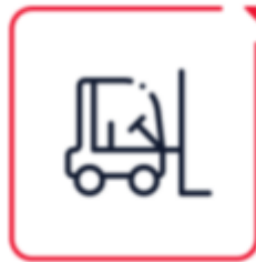
Warehousing & logistics