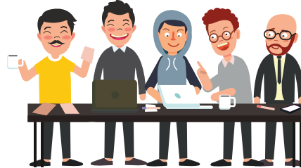
Public Providers Business Angels Start-ups Project Partners Business Experts