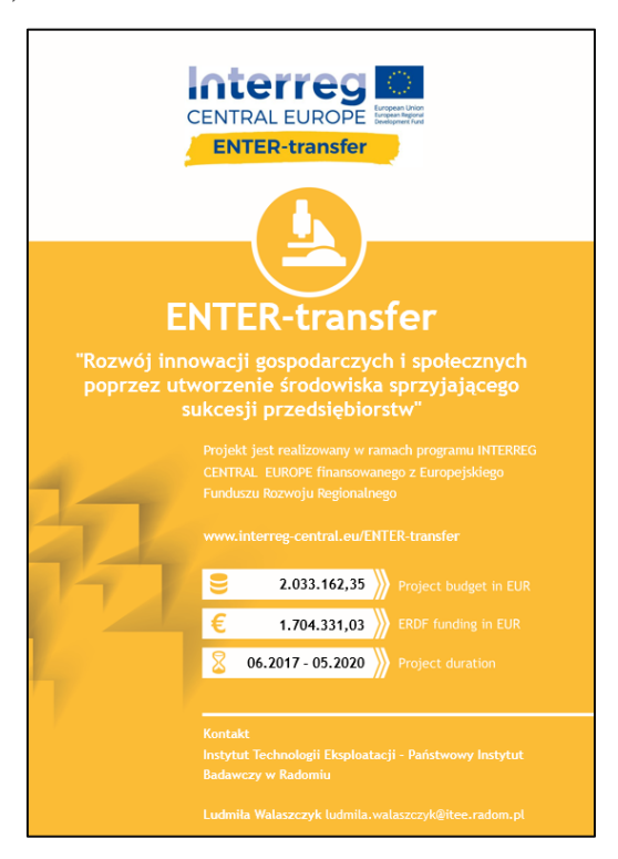
Annex no. 2 - Programme of the meeting (in PDF)