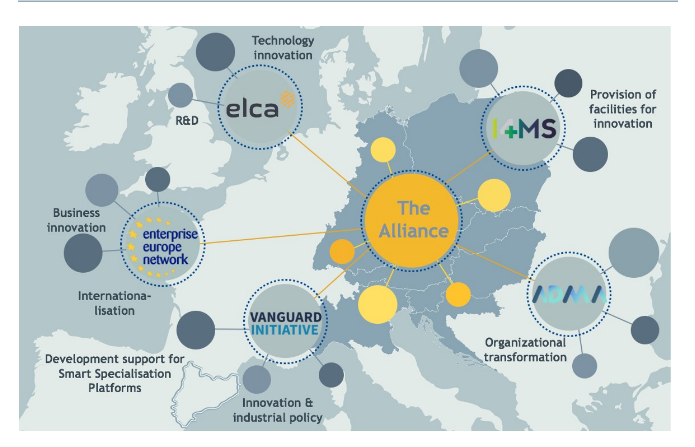
Figure 3 Building important strategic partnerships to create value

As the success of the Alliance is built upon those relationships and connections, policy actors and/or funding programmes can support such Alliances by laying a focus on investing in cooperation culture & human relationships . To ensure the continuation of their work, investments in people that are in key positions in the cooperation as well as investments in operation capacity are of paramount importance.