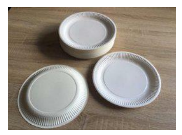
Fot. 1. 100% bodegradable paper plates laminated with NatureFlex cellulose foil

On the Polish market there are products from this group made of paper (paper, cardboard or cardboard), laminated with NatureFlex cellulose film (paper plates, various types of cardboard boxes). In addition to aqueous glue and paints, they consist entirely of cellulose-derived materials.