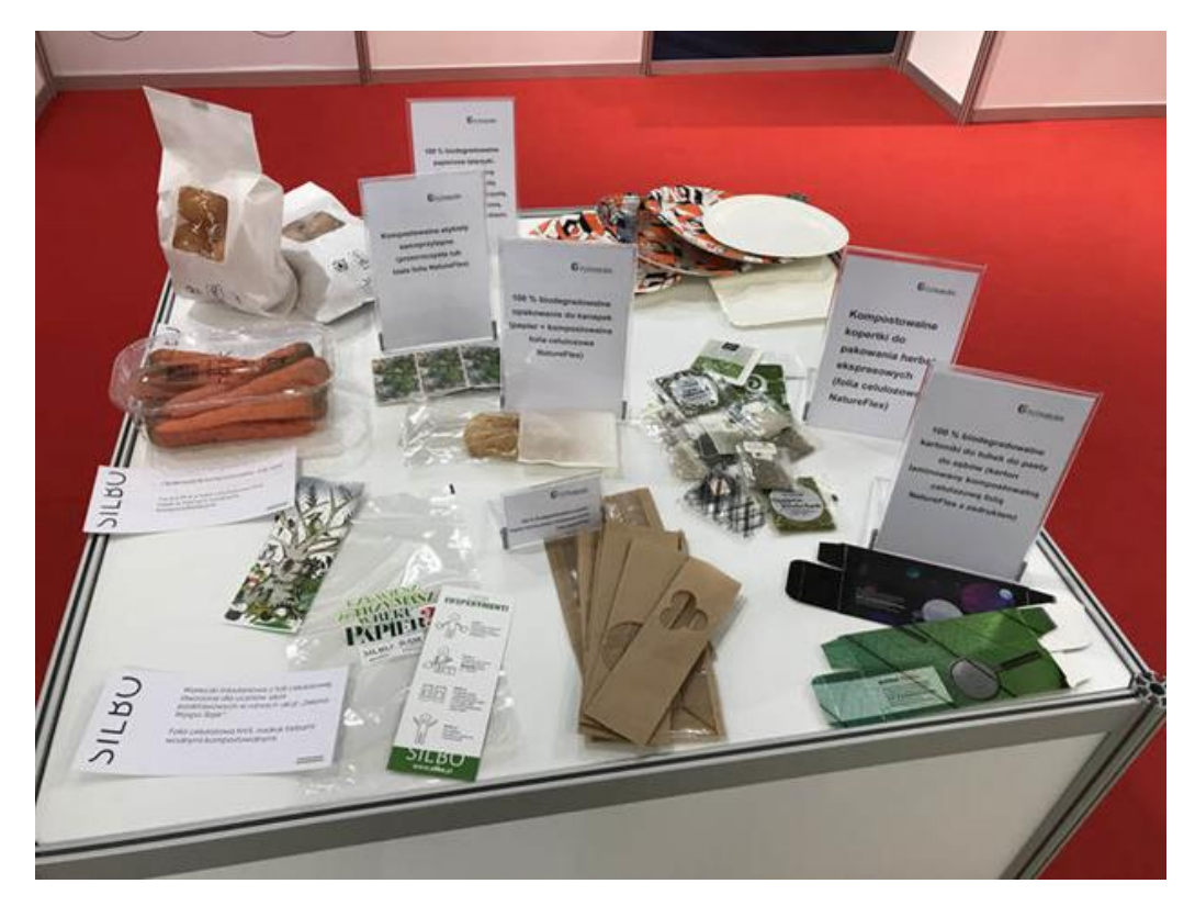
Fot. 2. The SILBO company offer during the Warsaw Pack Fair (as part of the Polish Chamber of Packaging showroom), during which the BIOCOMPACK-CE project was also presented.