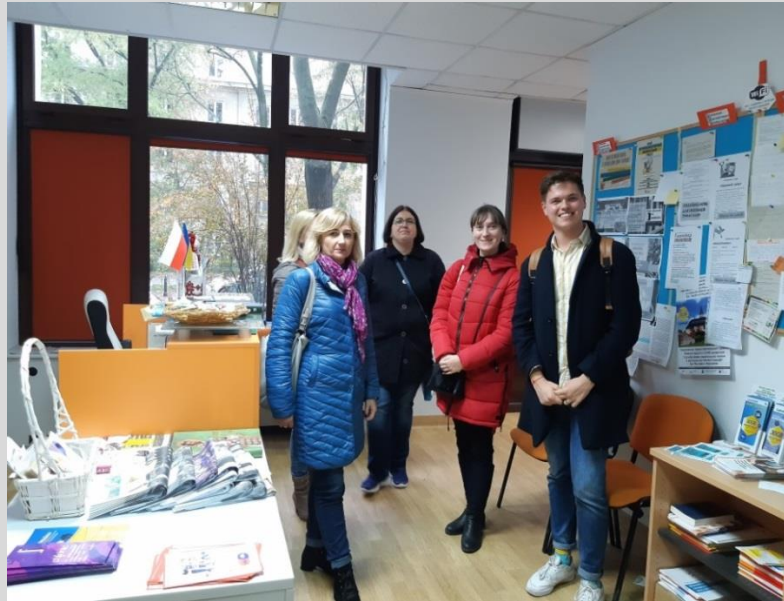
Pic. 2 The end of the study visit