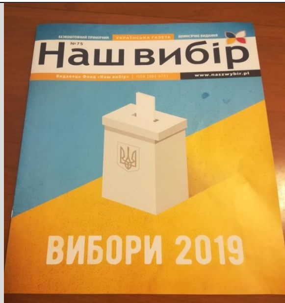
Fig. 3 The Newsletter "Our Choice"

The Foundation conducts sociological research. In cooperation with the Foundation of Socio-Economic Expertise Institute, the Foundation implemented the project "Immigrants with high qualifications on the Polish labor market. Social research" . The main objectives were to provide knowledge about the labor market situation of immigrants with higher education diploma, and reveal obstacles in the integration of immigrants on the labor market, especially those related to the social image of immigrants as well as employees and employers.