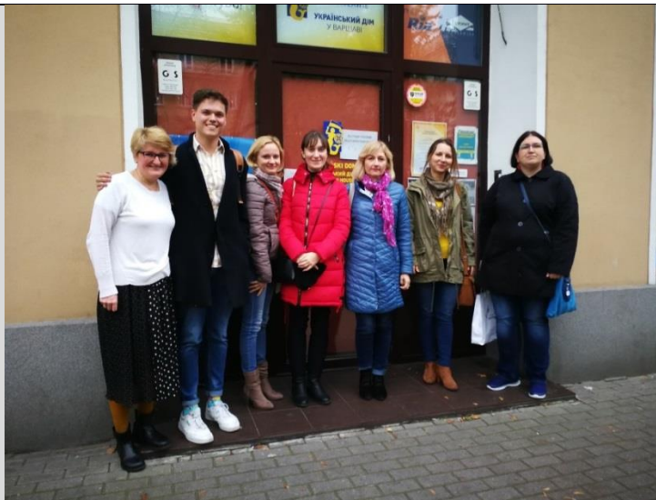
Pic. 5 At the entrance of foundation headquarters