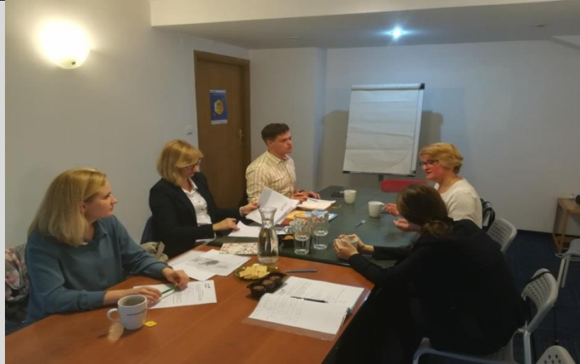
Pic. 4 During the meeting in „Our Choice“ Foundation