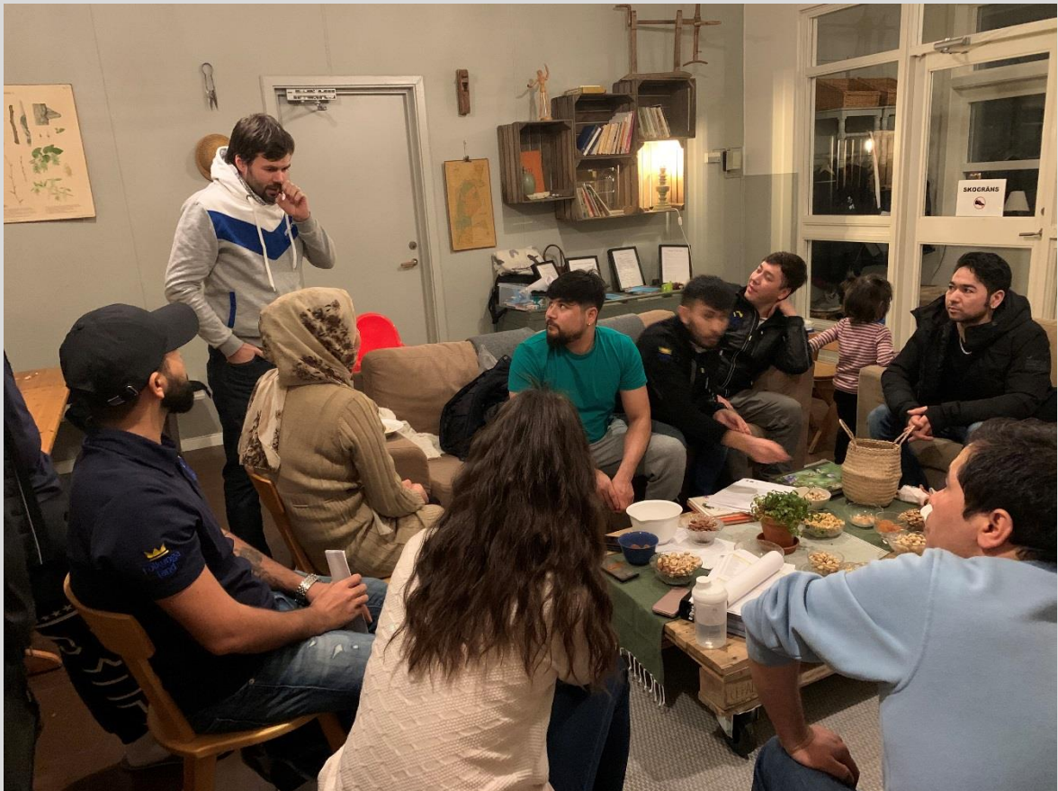
Pic 6. Get-to-know-each-other exercise.

After the initial meeting, we were driven to Omberg Ecopark, where the mini-camp was taking place. Upon our arrival, we met the rest of the participants, were assigned to the group where we acted as immigrants discovering Swedish culture (which was actually true), received schedule of activities for the whole weekend and joined the get-to-know-each other exercise.