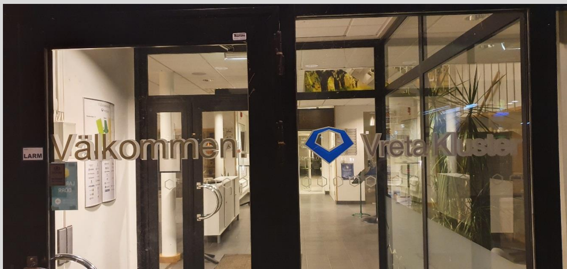
Pic 1. Business Park at Vreta Kluster.

Ny på landet began in 2011 as an interregional cooperation between three LEADER areas in Sweden. The project targeted ethnic organisations from the cities and civil rural groups. At the time, the project operated a range of activities focusing on three blocks: employment, housing and culture/leisure.