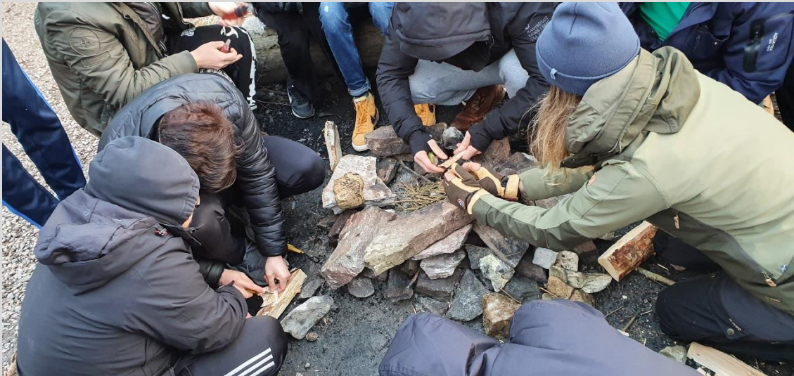
Pic 7. Hiking and survival at Omberg Ecopark.

During the whole day, teams were working on “young reporters” activity. Point was to make a short video about one of the following issues: “Right of public access”, “Litter-what to do about it” and “Recycling”. At the end of the day, videos were screened, and jury of head team leaders assigned points according the several criteria: message, story-telling, involvement of all team members, thoroughness and others.