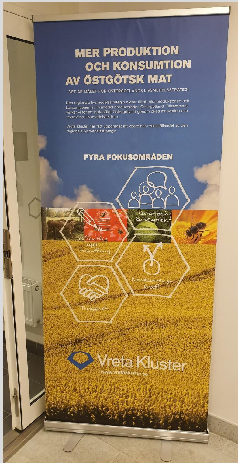
Pic 2. Vreta Kluster.

them to integrate into Swedish society. Today, the project is managed by Folkungaland, a LEADER area that covers seven municipalities in the east of Sweden.