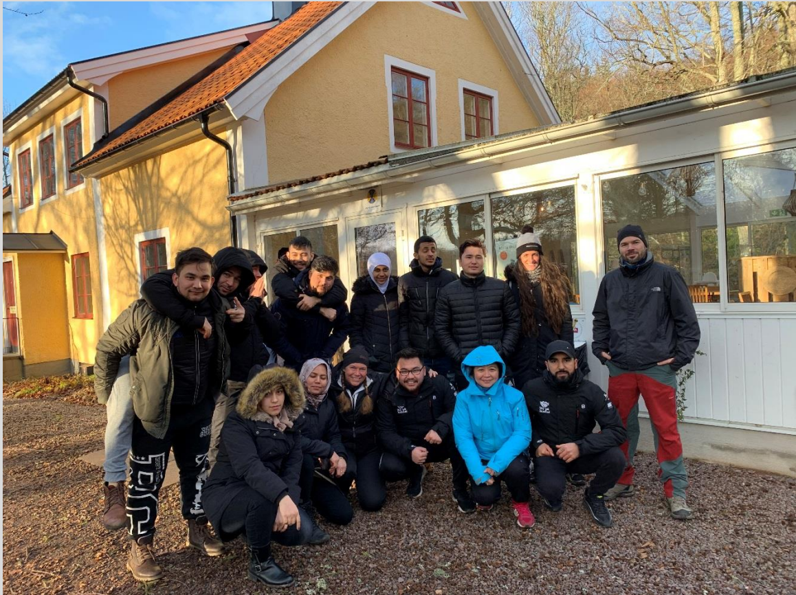
Pic 11. Group picture at Omberg Ecopark.

in general, but also in civic sector. The role of the team leaders supports and develops strong sense of responsibility, justice and authority, creativity, initiative, solution-oriented attitude, respect for other people's time, decisiveness, ability to improvise but also openness to criticism and readiness to accept it and use it for further personal development.