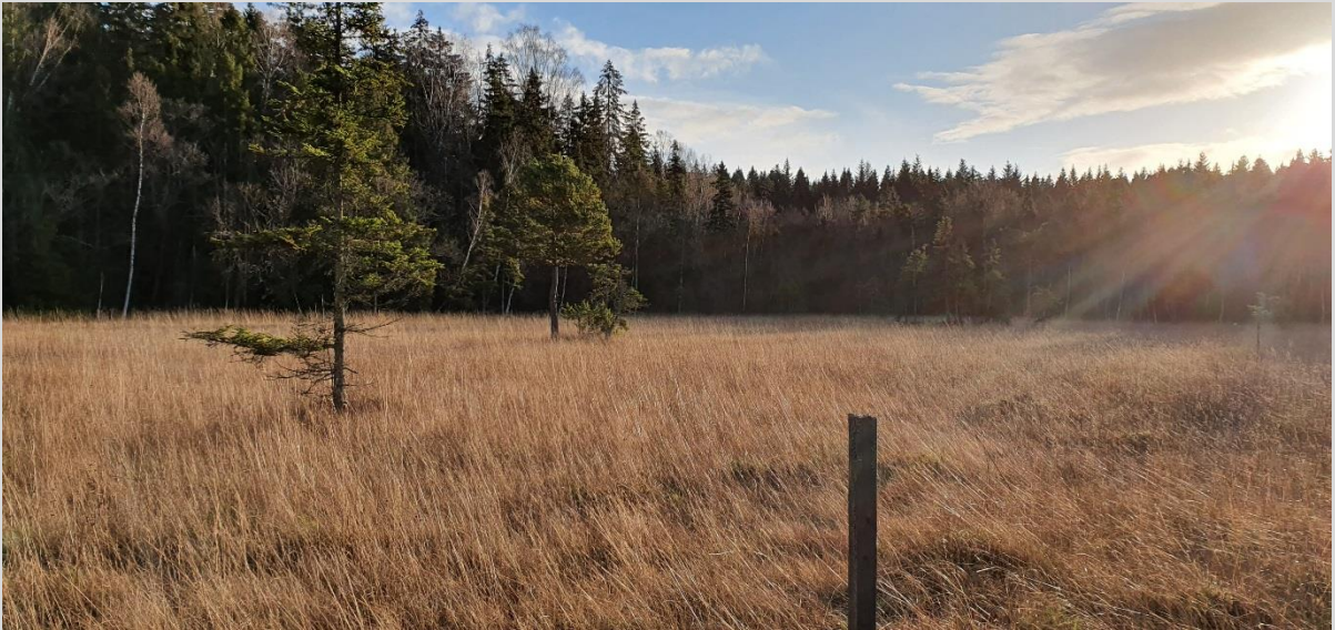
Pic 12. Omberg Ecopark.

Many obstacles in the communication between project leader/team leaders and younger participants/newcomers are prevented by putting emphasis on information meeting. Before anyone can participate in activities like camps or others, she/he must be personally presented on an information meeting, where is introduced not only to opportunities that project offers, but also to obligations and duties that comes with the participation.