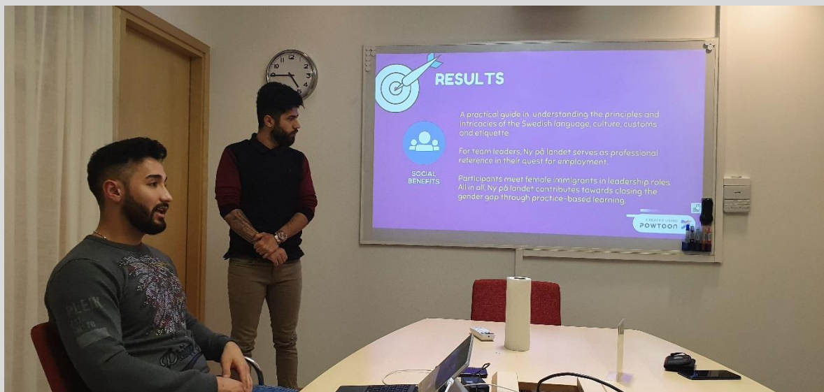
Pic 4. Head team leaders explaining the project.