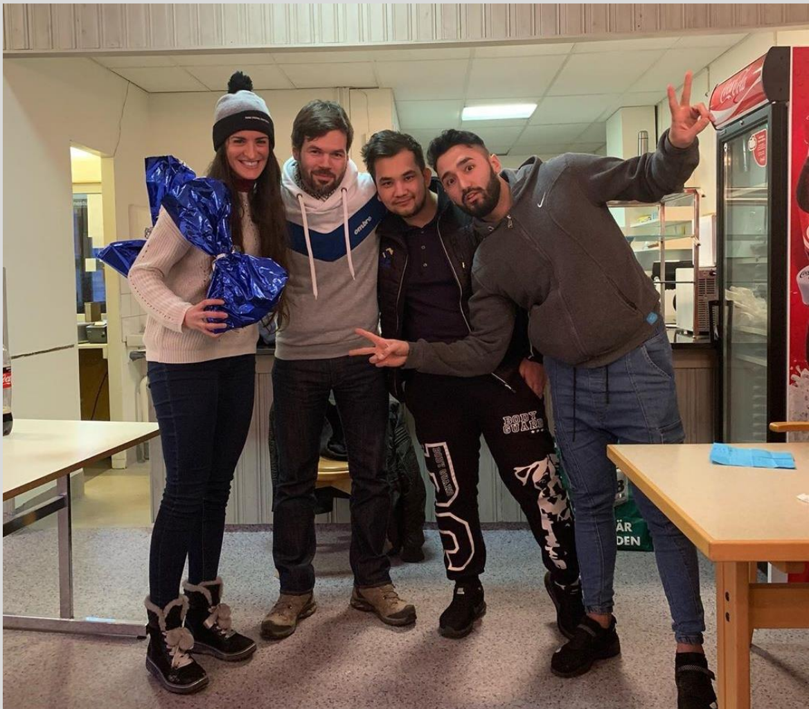
Pic 9. PP12, PP7 and Head team leaders.