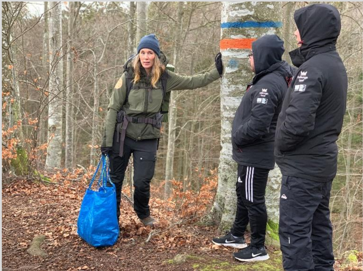
Pic 3. Hiking at the Omberg Ecopark.