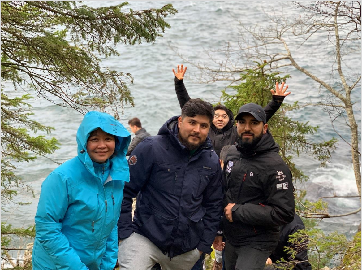
Pic 10. Project leader and team leaders at Omberg Ecopark.

Migrants are included in all stages of process and all aspects of Ny på landet activities such as planning, implementation, evaluation, administration and marketing. They are responsible for guiding and leading their teams as they compete in camp games and participate in other camp activities (cooking, cleaning, etc.). Target is to transfer the leading role in the project to immigrants. All of the 16 team leaders (who are also immigrants) work as volunteers, which shows their integration not only to Swedish society