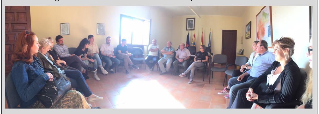
Pic. 4. Meeting in La Cerollera.

While the migrant organizes the relocation, the municipality should inform local community about arrival of the new community member. As most of the rural communities tend to be rather conservative and closed, some members of the community can see the new inhabitants as a threat to their peace and normal day routine. Therefore, the mayor or other key persons should use their influence to communicate positive changes that the new immigrant family might bring to the village. After the arrival, the municipality must introduce migrants to all of the important members of local community: teachers, doctors, persons managing communal space etc. Moreover, the municipality is responsible to support migrants in various issues that can arise during the first months in the new community.