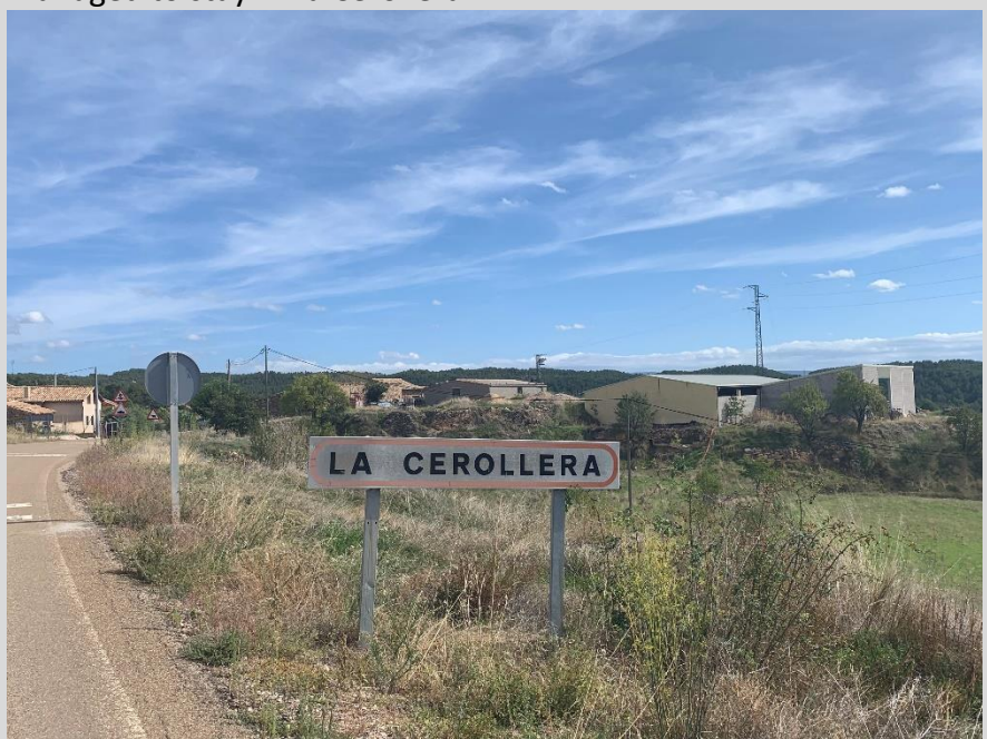
Pic. 2 The entrance to La Cerollera.

realities. In order to understand the main issues immigrant families face arriving to rural Spain, the project team needed to organize an interview with the migrant families, who managed to stay in La Cerollera.