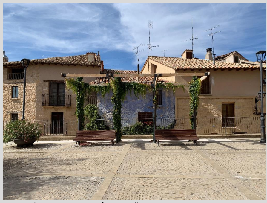
Pic. 3. The main square of La Cerollera.